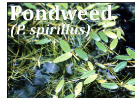
Pondweed ( P. spirillus )