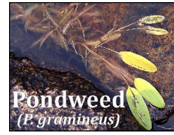
Pondweed (P. gramineus)